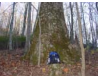
110' tall, 5' diameter yellow-poplar

Nature Trail --Labeled signs (2 nd Lake)