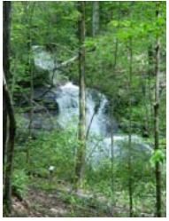
Waterfall on East Perimeter Trail